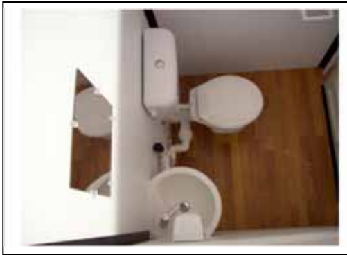
Fig. 4 Top View