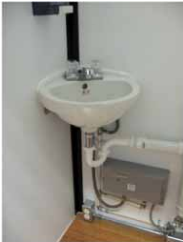
Tankless Hot Water Heater for Sink