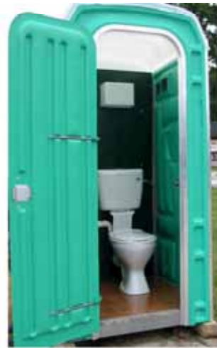
Model SJDCS 520 Front View