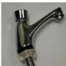
Chrome Water Faucet Automatic 9 Second Shut-Off Water Saving Feature