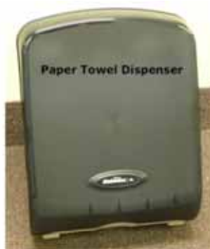
Paper Towel Dispenser With Initial Paper Towel Supply