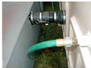
Water & Waste Hook-up