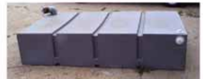
Model HT 304 300 Gallon Waste Tank