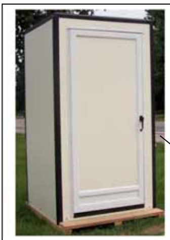
Fig. 7 Front View Closed Door