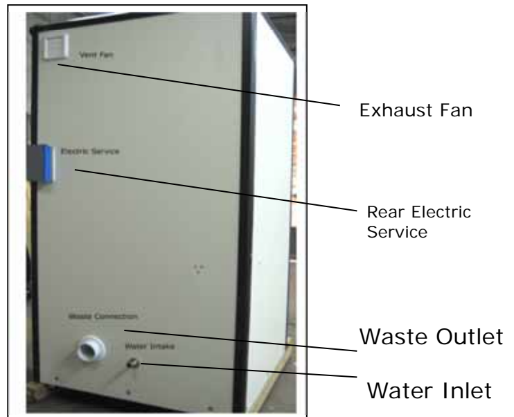
Fig. 8 Rear View Plumbing Connections