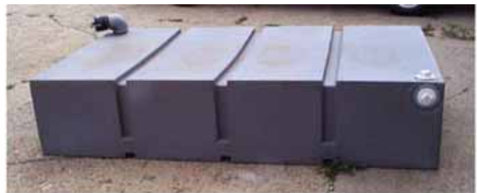
300 Gallon (1,200 Liter) Waste and Water Tank