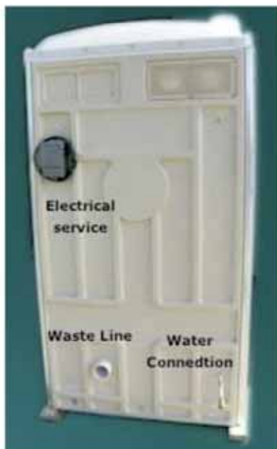
Model SJDCS 520 Rear View with Electricity Option