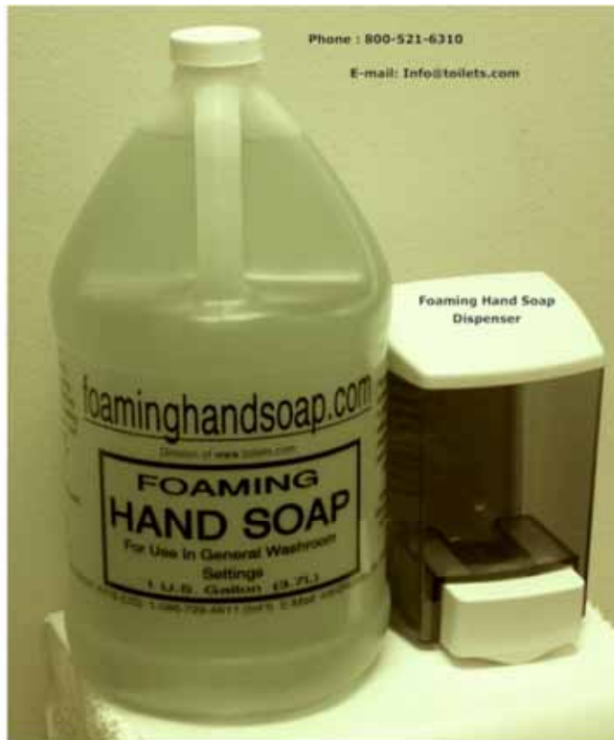
Foaming Hand Soap Dispenser with Initial Supply of Liquid Foaming Hand Soap www.FoamingHandSoap.com