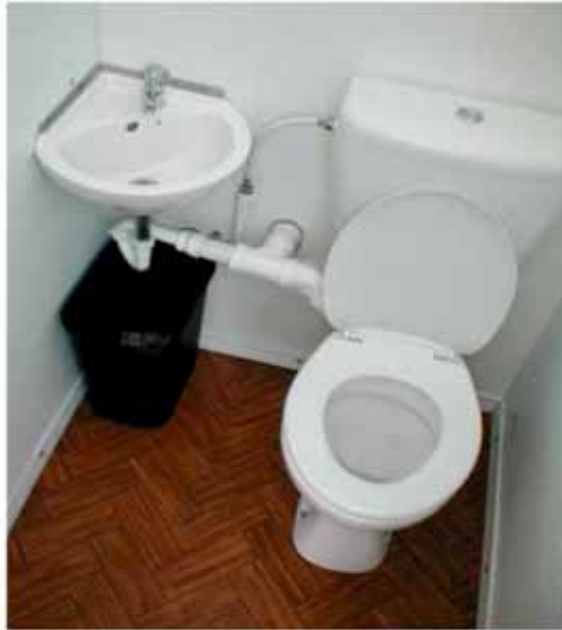
Inside View of Model SJSPCS 600