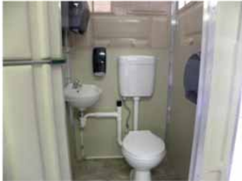
Model SJSDCS 520 with Foaming Hand Soap and Jumbo 5-Roll Paper Roll