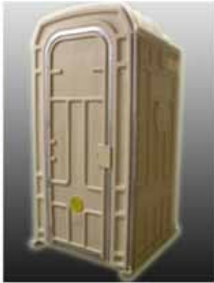
Model SJSPCS 600