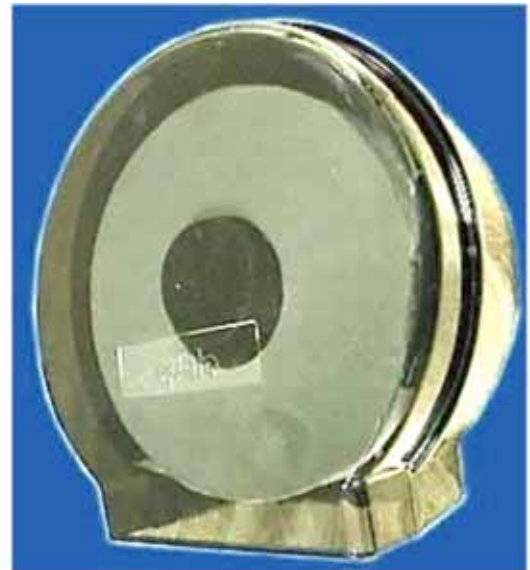
Jumbo 9" Toilet Tissue Dispenser Equivalent to 5 Standard Toilet Tissue Rolls Includes Initial Jumbo Tissue Roll