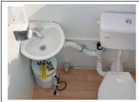
Fig. 6 Open Door Front View