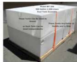
300 Gallon Water Tanks