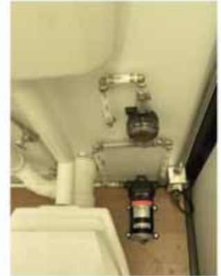
Water Pressure Pump & Filter